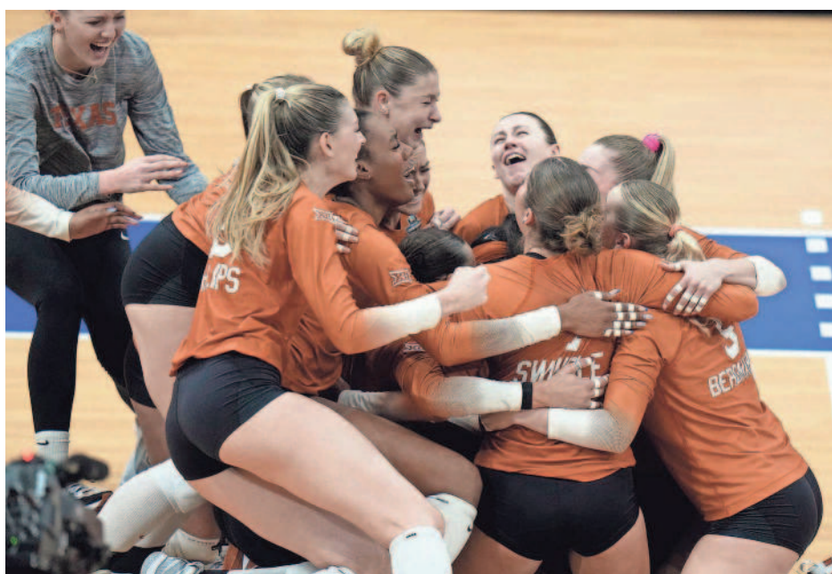
Texas players celebrate after defeating Nebraska on Sunday to win the NCAA Division I women's volleyball championship.